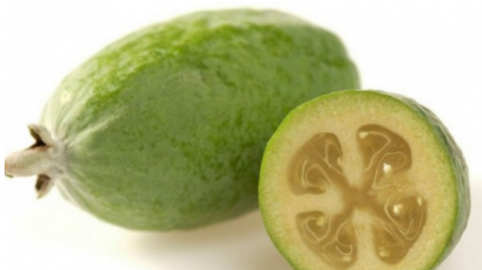
Image 2. Feijoa pulp with high nutritional benefits.

For all the reported benefits that the feijoa presents in the nutritional status of the human being along with the little information that is available about its effects on patients suffering from diabetes mellitus (high blood sugar levels) in our laboratory, we decided to investigate as a main target if the feijoa juice helps reduce blood glucose levels.