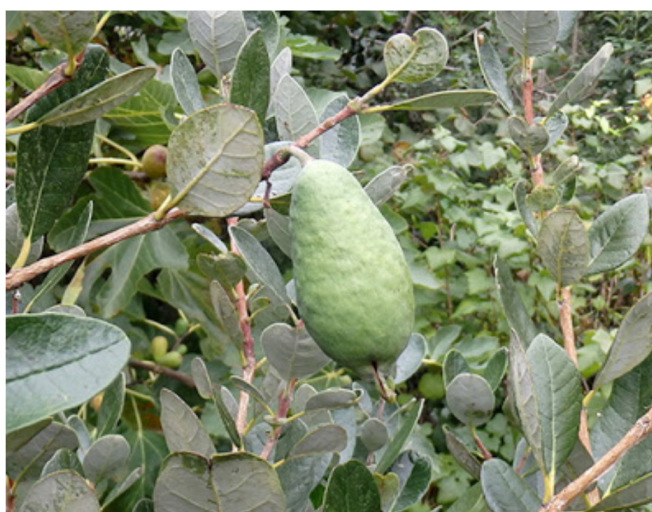
Image 1. Ripe Feijoa.