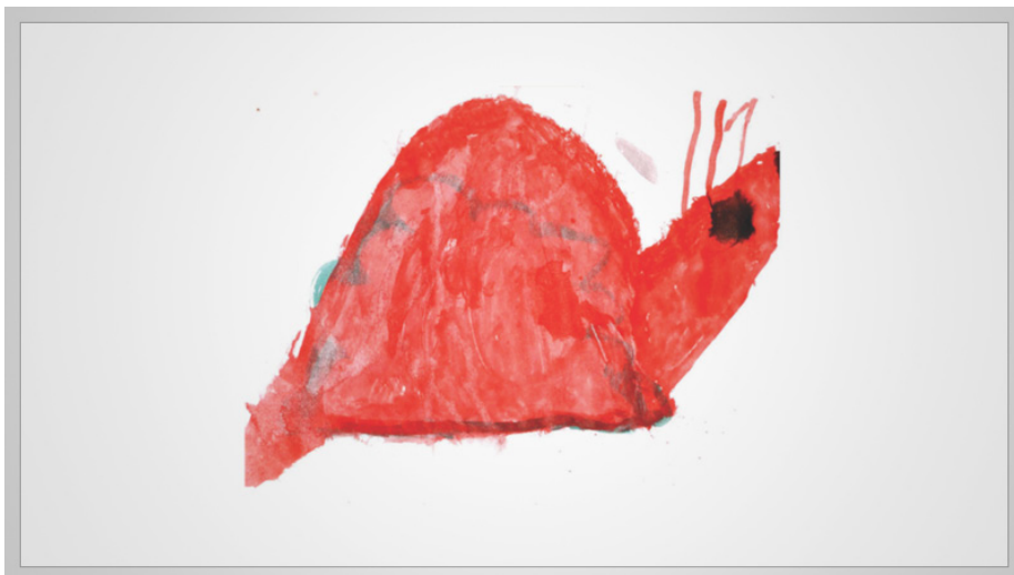
Figure 1. Drawing of snail.