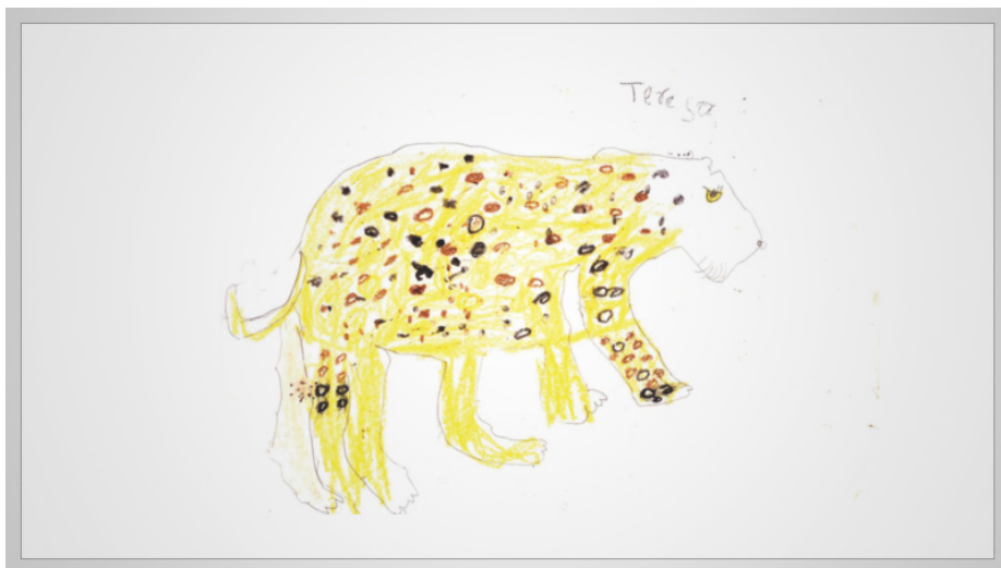
Figure 3. Drawing a jaguar.

The Chum Cerro neozapaitstas families have a teacher who occupies a portion of his time teaching because of his many activities . Only one parent sent two of their children to the New Sabanilla school , A Chol speaking town that is an hour walk from the community ( See Figure No. 3).