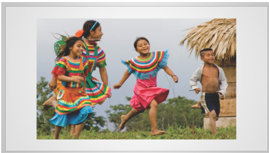
Figure 2. irls playing