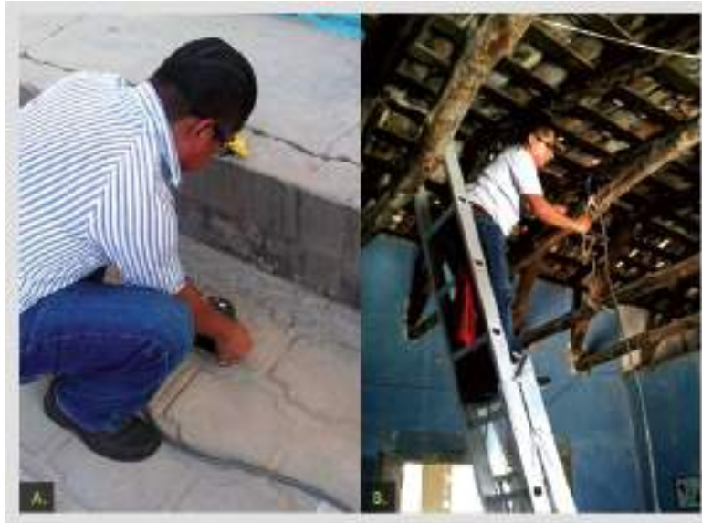
Figure 2. a)Installing the accelerometer on the floor, b) Installing the accelerometer inside the house

Subsequently the accelerometer was installed in the house to obtain the necessary measurements to determine the fundamental periods of vibration in the house and in the corresponding soil. According to seismograph records stored in 3 orthogonal dimensions of 30 seconds duration each, and based on the calculations of the Fourier spectra in each record, the transfer function, or spectral ratio was established using the Nakamura technique. The results indicate that the fundamental vibration period on average is high: (. Escamirosa, et al, 2013) at 0.2133 seconds in the soil to 0.1506 seconds for the house(Figures 2 and 3).