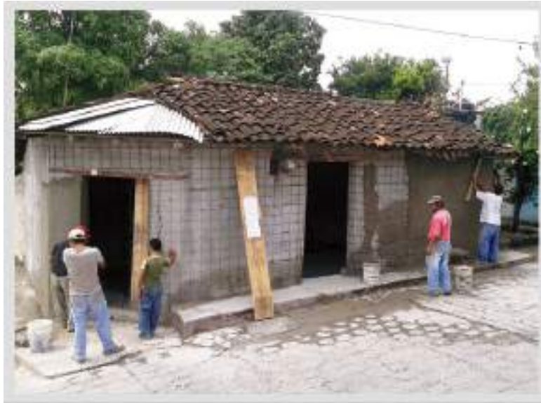
Figure 6. Application of the second coat of cement-sand mortar