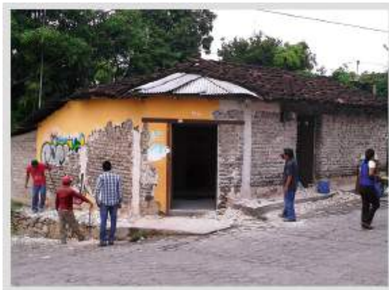
Figura 4. Removal of the existing mortar on the house