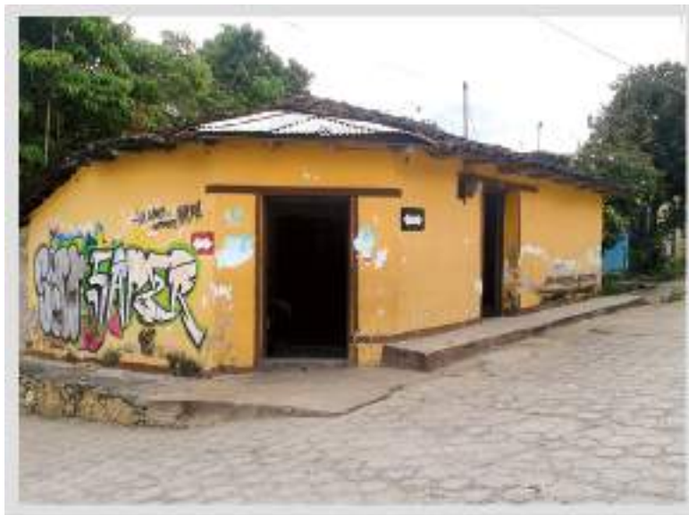
Figure 1. Traditional adobe home owned by Evangelina Aguilar Montero

In this paper reference is made to one of the selected households, owned by Evangelina Aguilar Montero who noted that the property is more than 80 years old. The property is located in seismic zone 1, between Avenida Miguel Hidalgo and Calle Tomas Cuesta, in the San Vicente neighborhood, with geographic coordinates UTM (498673.62, 1847525.79) and an elevation of 433.78 meters above sea level. Its structure is formed by a stone masonry foundation, 40 cm. thick adobe walls, clay tiled roof supported with a structure of round wooden beams and planks. In the visual structural assessment, serious cracks in the walls and cracks in the corners we observed, which adversely affect the stiffness and cause an increase of the vibration period of the house (Figure 1).