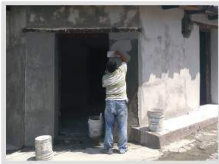
Figure 7. Lime plaster with cement