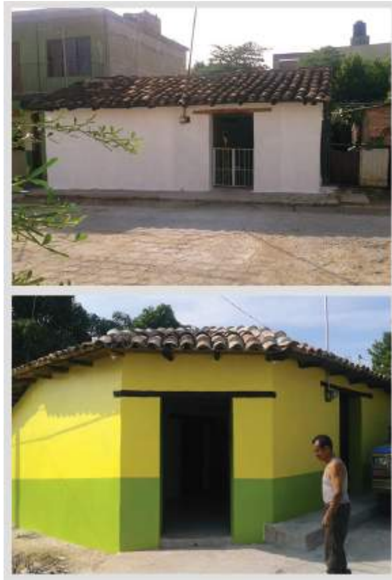
Figure 14. Result of structural reinforcement in housing.

vibration. The new measurements made it possible to assess the evolution of the seismic capacity in both traditional adobe houses of the historic town of Chiapa de Corzo.