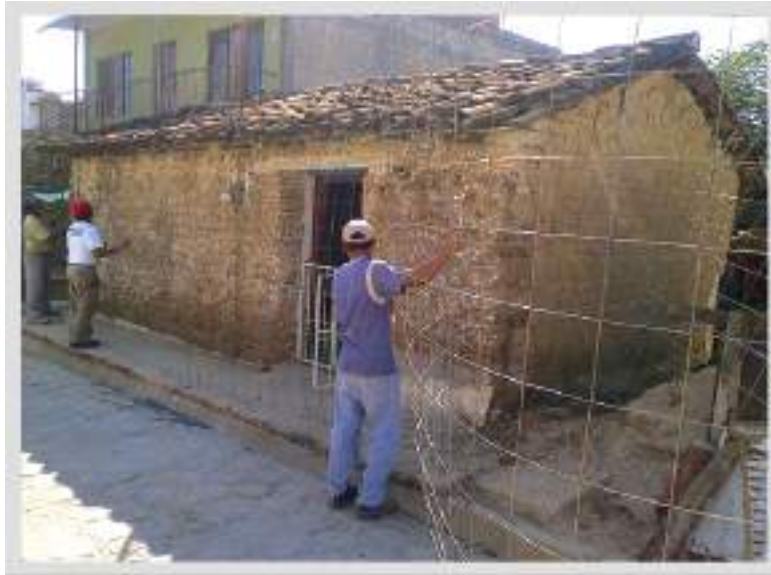
Figure 10. Attaching the wire mesh