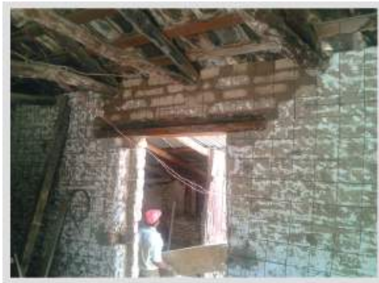
Figure 9. Strengthening the existing lintel with a pine wooden plank.