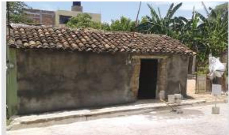
Figure 13. Application of the cement-sand mortar