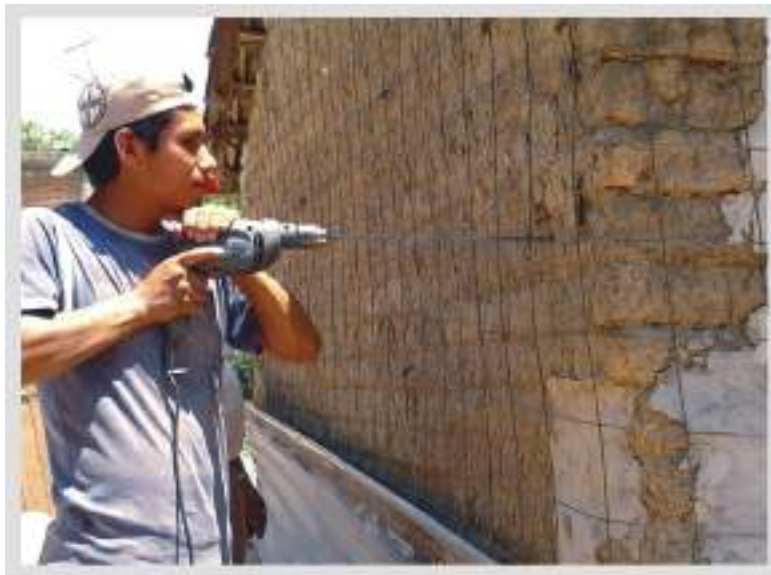
Figure 11. Drilling the adobe to fix the steel mesh