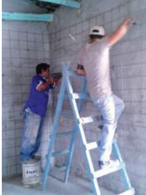
Figure 5. Attaching the wire mesh 6x6 / 10x10 inside the housing

1.35 m. and annealed wire at a smaller lattice of 45 cm. Overlaps of mesh sections were performed at 60 cm. (Figure 5).