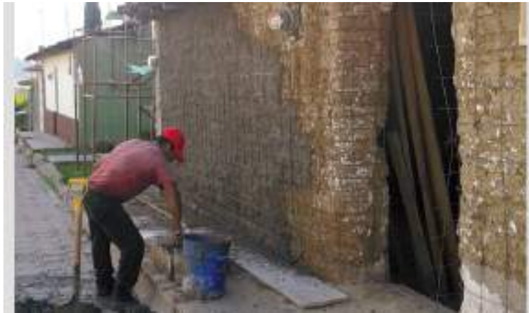
Figura 12. Application of cement-sand mortar

hrs.), the second layer of a minimum thickness of 1 cm was applied., which was smoothed with wooden trowel. Similarly as in the previous housing, troweling was performed according to the level of the vertical walls (Figure 12 and 13)