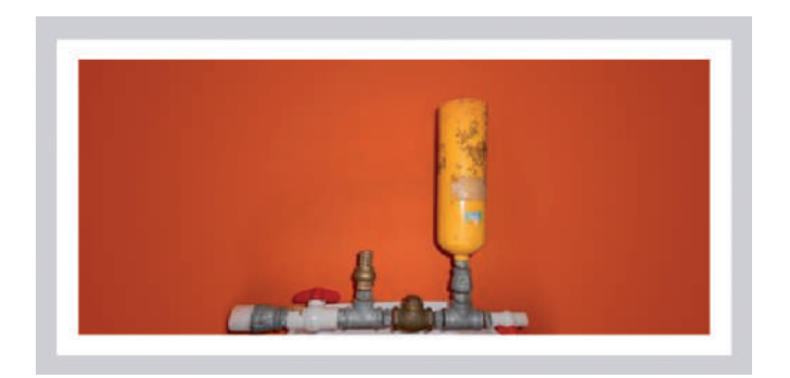
Foto 5. Hydraulic ram pump, Research Center, School of Engineering

Hydraulic ram pump (HRP). The HRP operates continuously for 24 hours using only hydropower. It is powered by a natural or artificial drop of at least 1 meter high. There must be a constant flow of the supply source, which can be a stream, river, small dam or tank. The recommended minimum flow of the source must be 2 l/sec and the minimum hydraulic load should be 1 m high. If the minimum height between the source and the entrance to the HRP is 1 m, it can push water up to 10 m in height.