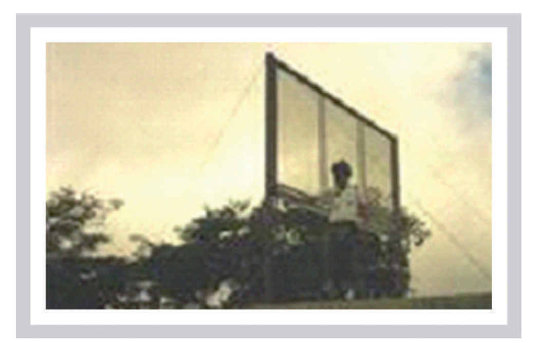
Photo 2. CAN experiment outside of the Llano San Juan Airport, Ocozocuautla, Chiapas