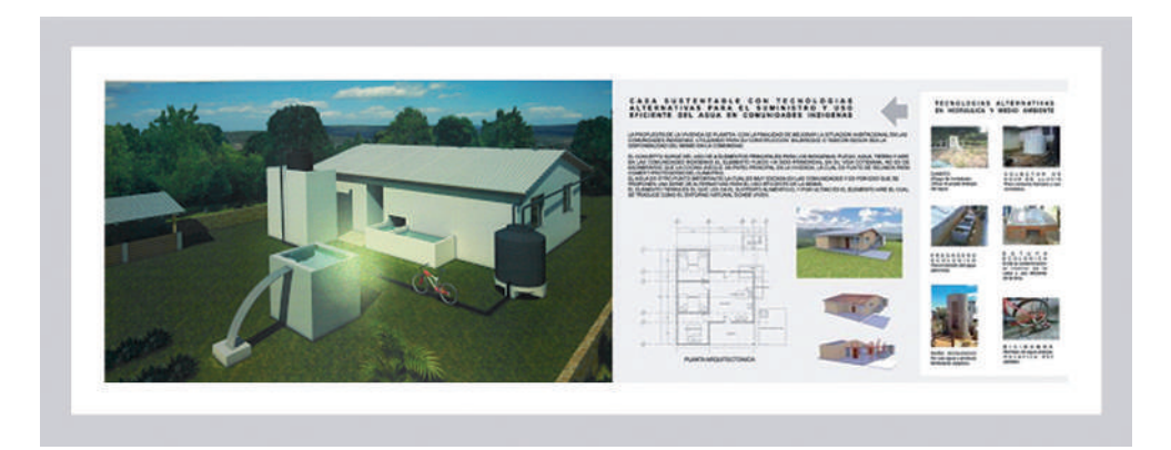
Figure 1. View of sustainable house

Household rain water collector (CALLD) . The CALLD is a circular tank, made of reinforced cappuccino brick with electro – welded metal mesh, plastered inside and outside. It has a filter that cleans the water of impurities and where you can chlorinate if necessary (Figure 2). It is economical because the cost is equivalent to $ 0.10 USD per liter and tanks over 35, 000 liters can be built. It competes with the cost of companies that sell plastic tanks (PVC or HDPE), but the CALLD is outstanding for its durability